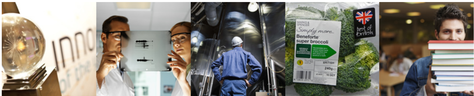
1. BBSRC. 2. Thinkstock 2012. 3. Getty Images. 4. IFR. 5. Thinkstock 2012