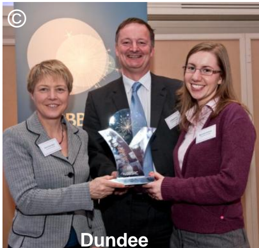
Dundee Greatest Impact