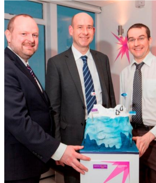
University of Manchester UMIP Runners-up