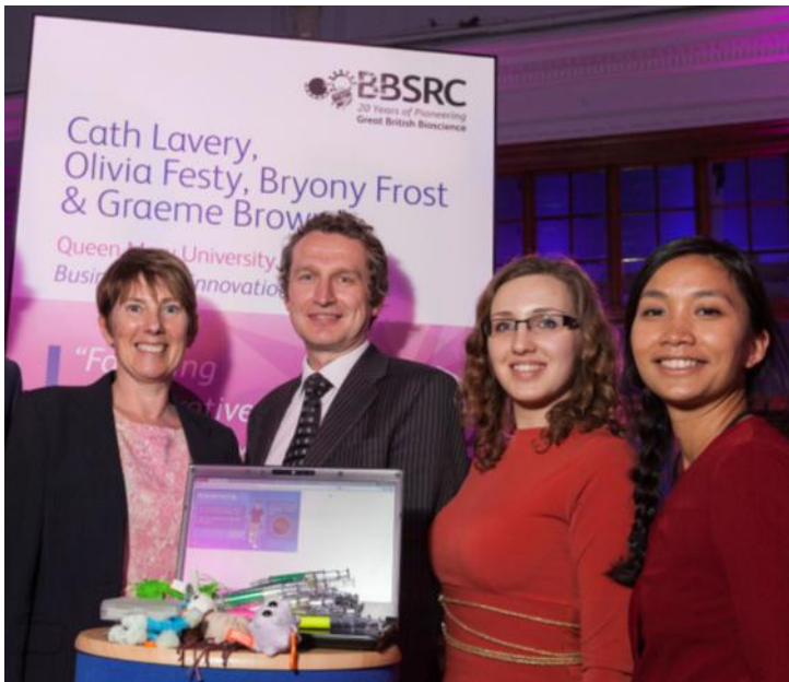
Queen Mary University of London