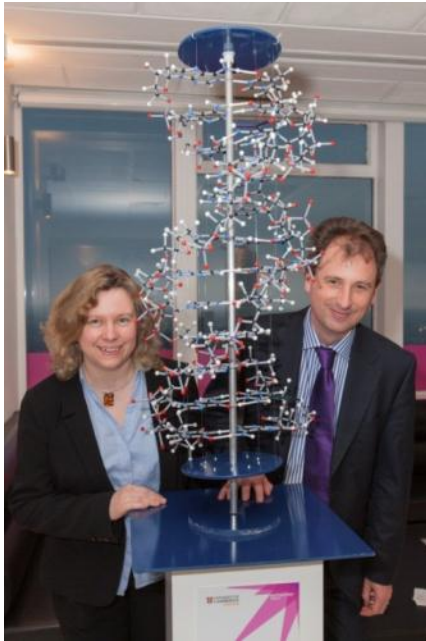
University of Cambridge Cambridge Enterprise Ltd. Runners-up