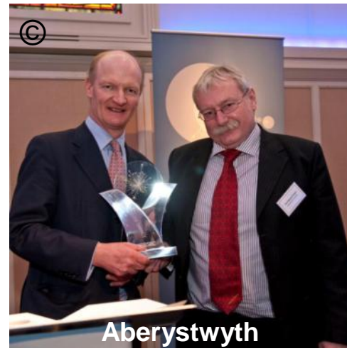
Aberystwyth Greatest culture change