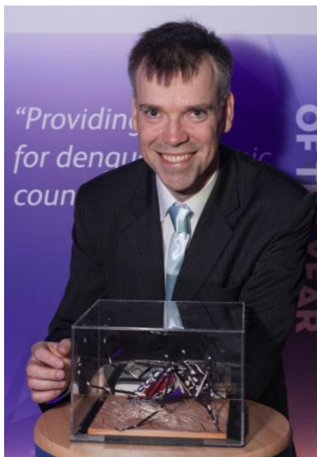
Overall winner Innovator of the Year