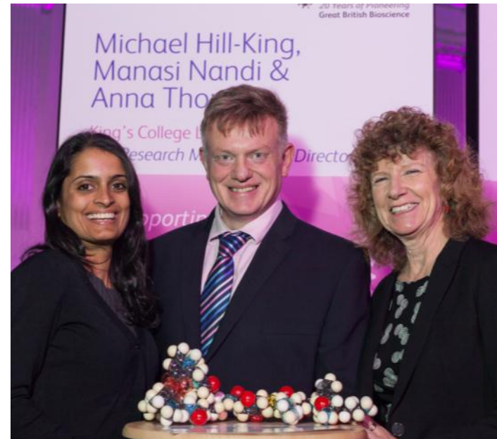
King's College London