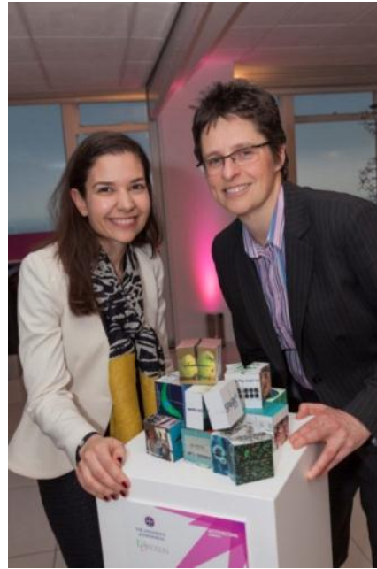
University of Edinburgh / Roslin Institute Edinburgh Research & Innovation Overall Winners